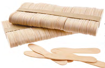
Wooden ice cream spoon Size: 75 x 16 x 1.35mm Packing: 100pcs x 200bundles/ctn