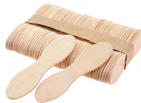
Magnum stick Size: 72 x 17.5/11 x 2mm Packing: 50pcs x 200bundles/ctn