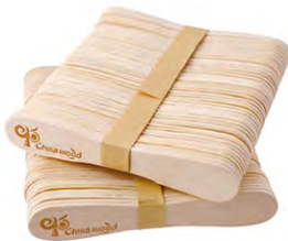
Magnum stick Size: 94 x 17.5/11 x 2mm Packing: 50pcs x 200bundles/ctn