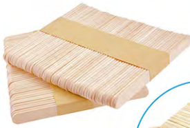
Wooden/bamboo ice cream stick Size: 114 x 10 x 2mm Packing: 50pcs x 200bundles/ctn