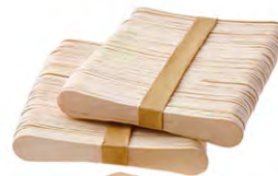
Magnum stick Size: 93 x 16/11 x 2mm Packing: 50pcs x 200bundles/ctn