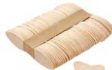
Wooden ice cream spoon Size: 76 x 18 x 1.5mm Packing: 50pcs x 200bundles/ctn