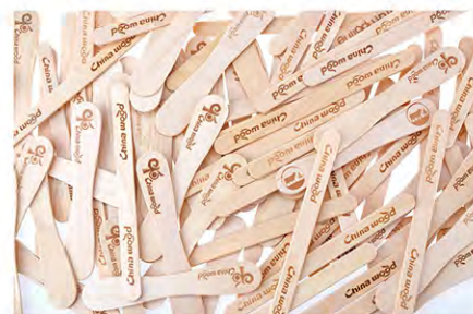
With hot stamping