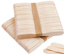
Wooden ice cream stick Size: 114 x 18/11 x 2mm Packing: 50pcs x 200bundles/ctn