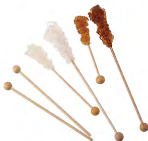
Wooden candy stick 3.0 x 150mm

Remark: Customers' packing requirements are workable