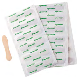
Paper wrapped ice cream spoon Size: 75 x 16 x 1.35mm Packing: 12pcs x 1000strips/ctn