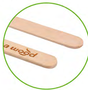
Straight edge Bevelled edge