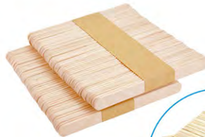
Wooden/bamboo ice cream stick size: 93 x 10 x 2mm Packing: 50pcs x 200bundles/ctn